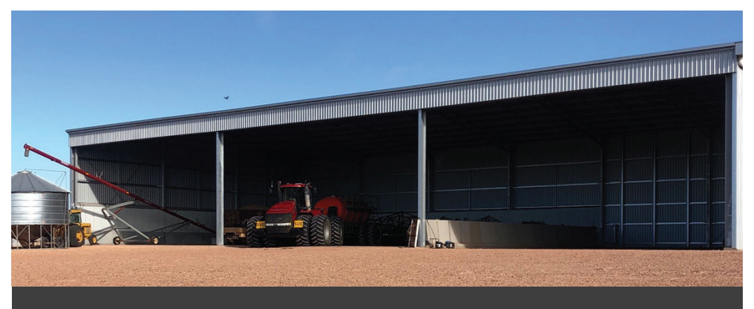
Redden Bros sheds 48.5m \times 28m \times 7.5m (Waddikee) $425,000 includes tank, pad, concrete [EP example 2019]