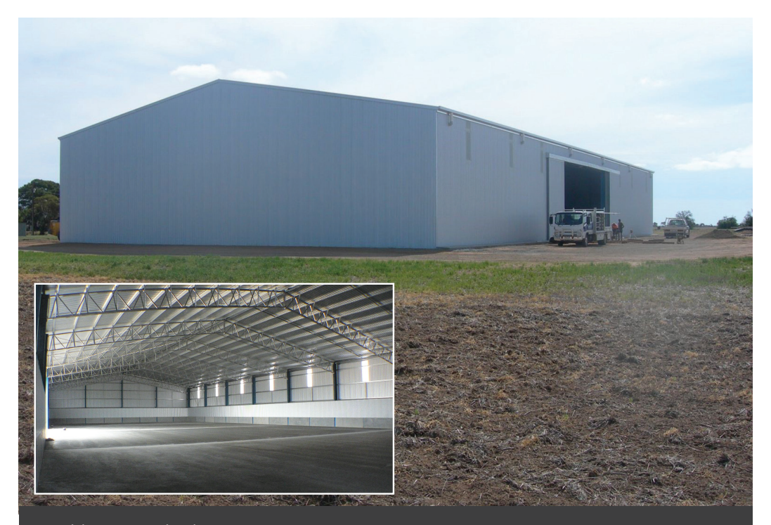
Redden Bros sheds 64m x 30m x 7.5m, full concrete floor and storage walls $655,000 + GST, YP example 2020