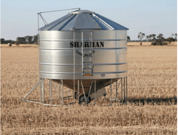
Sharman - Long Plains 35t Portabin $8,700 + freight. Pricing includes GST