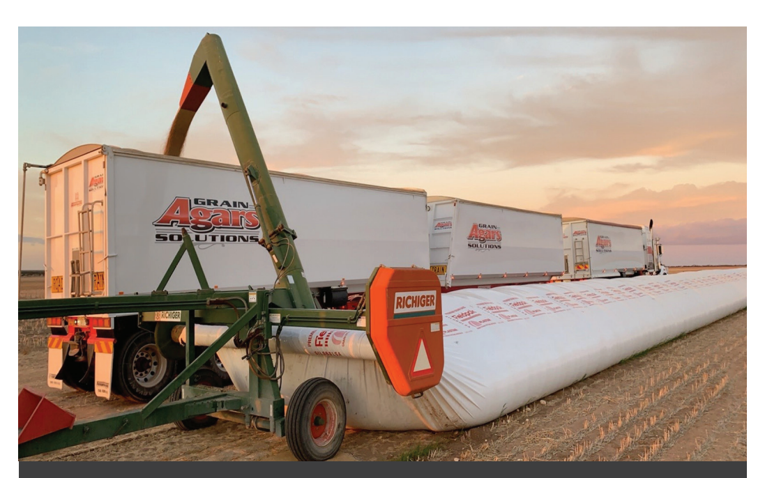
$25,000 for bag filler, $40,000 for bag un-loader, 75m or 220t bag, $840 1 x 220t bag costs approx. $10/t to fill and empty. Supplier: EP Ag n'Fert Kimba