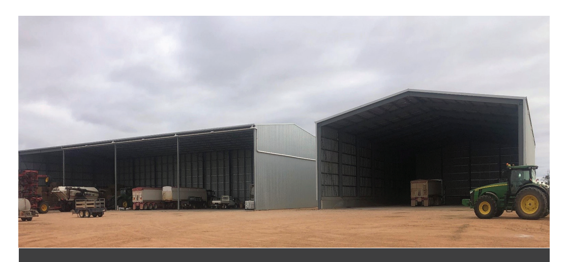
[60m \times 25m \times 10m] and [25m \times 50m \times 10m] sheds. [Wudinna] $420,000 (for both) includes tank, pad and concrete (EP circa 2015) Supplier: Impact Sheds